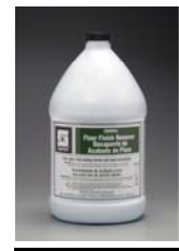
Green Solutions Floor Finish Remover Concentrate gal. $ 22.65 ea

2175 Martin Ave. Santa Clara CA. 95050 (408) 727-0271 ▪ fax (408) 727-3082 www.pacjan.com