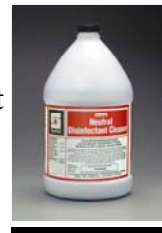
Green Solutions Neutral Disinfectant Concentrate gal. $ 12.70 ea