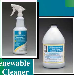
BioRenewable Glass Cleaner RTU Qt. $ 3.38 ea. Concentrate gal. $ 12.45 ea.