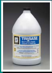
BioRenewable Tribase Multi Purpose Cleaner Concentrate gal. $ 14.10 ea.