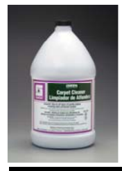
Green Solutions Carpet Cleaner Concentrate gal. $ 15.60 ea