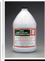
Green Solutions Floor Finish & Seal Concentrate gal. $ 22.45 ea

Let us help you solve THE GREEN CLEANING PUZZLE