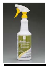
BioRenewable Graffiti Remover RTU Qt. $ 8.61 ea.