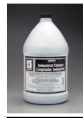
Green Solutions Industrial Cleaner Concentrate gal. $ 12.90 ea