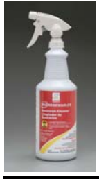
BioRenewable Restroom Cleaner RTU $ 4.12 ea